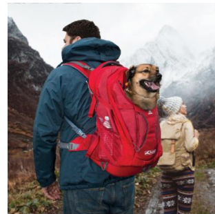
G Train Dog Carrier Backpack