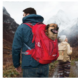
G Train Dog Carrier Backpack