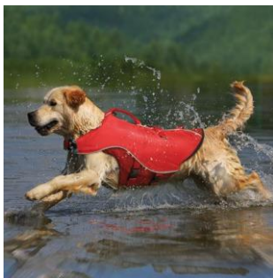
Surf n Turf Dog Life Vest